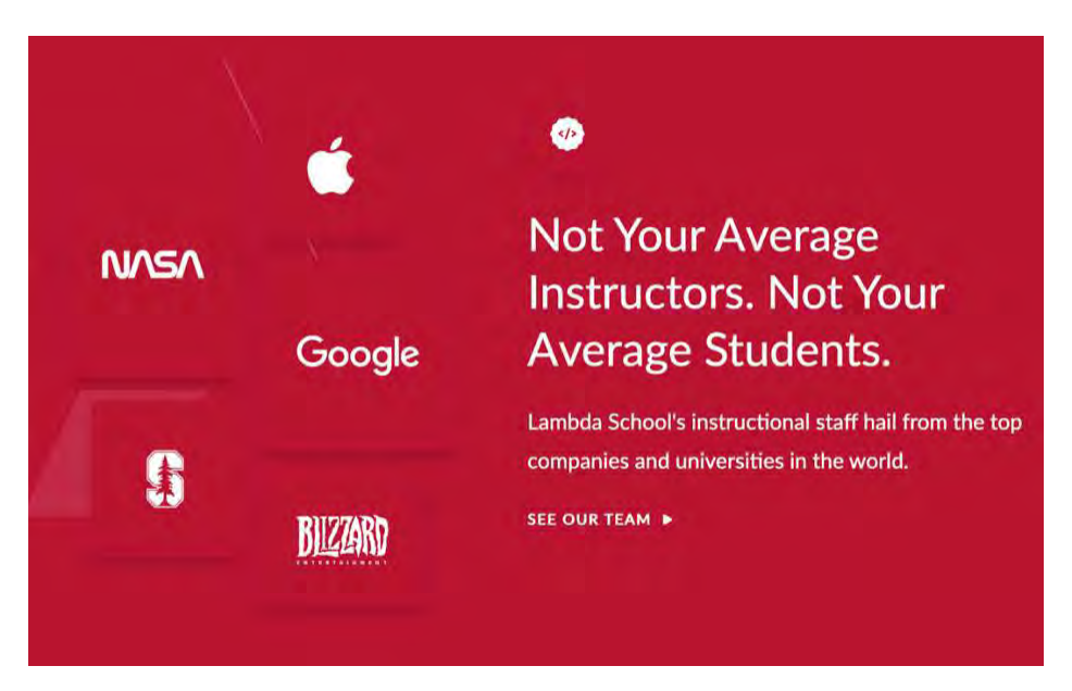
Screenshot from Lambda's website on June 15, 2019.

95. In fact, the curriculum—which was constantly in flux—was made up largely of publicly available online materials. The instructors had little knowledge