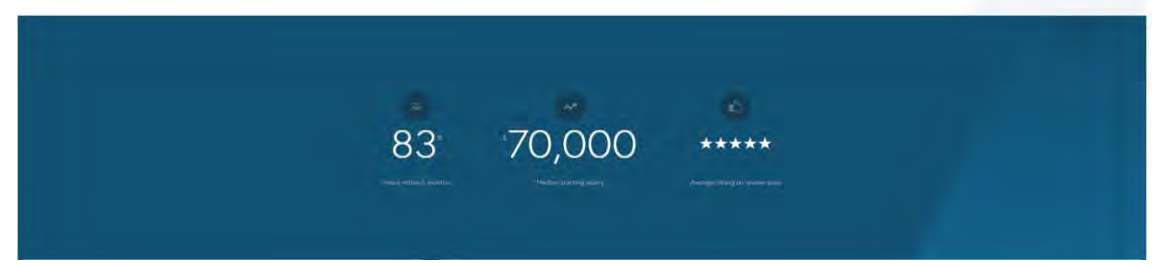
Screenshot from Lambda's website on December 13, 2018.