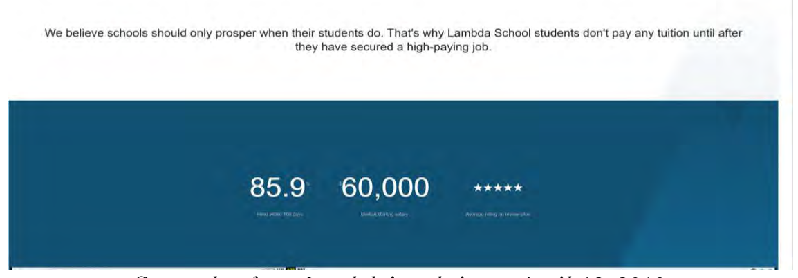
Screenshot from Lambda's website on April 18, 2019.

61. On March 5, 2019, Lambda's official Twitter account provided a link to a report touting the 85.9% job placement rate and stated: "Lambda only succeeds