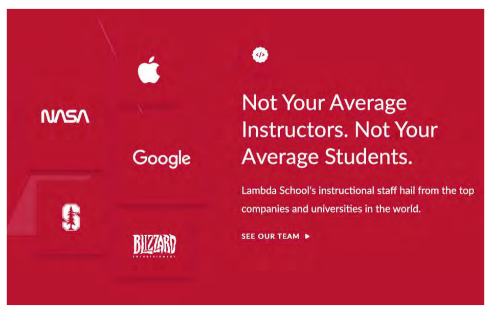
Screenshot from Lambda's website on June 15, 2019.