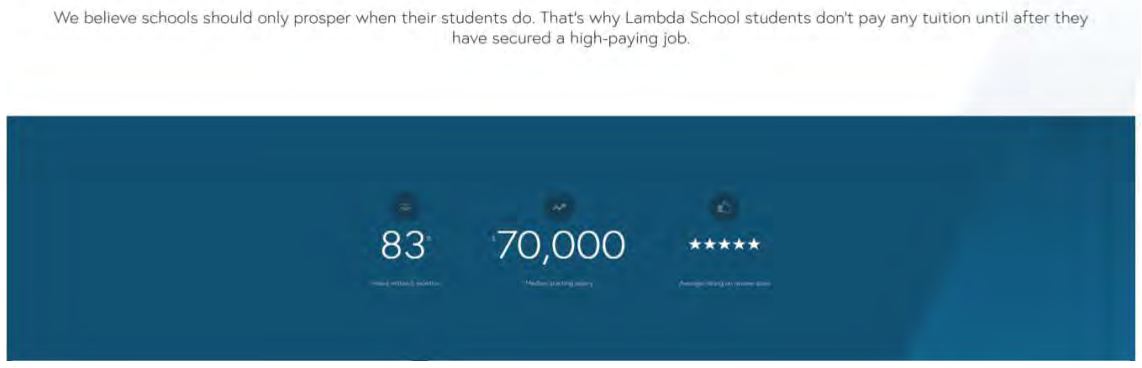
Screenshot from Lambda's website on December 13, 2018.

59. Lambda's homepage contained the following statement across the topof the page: